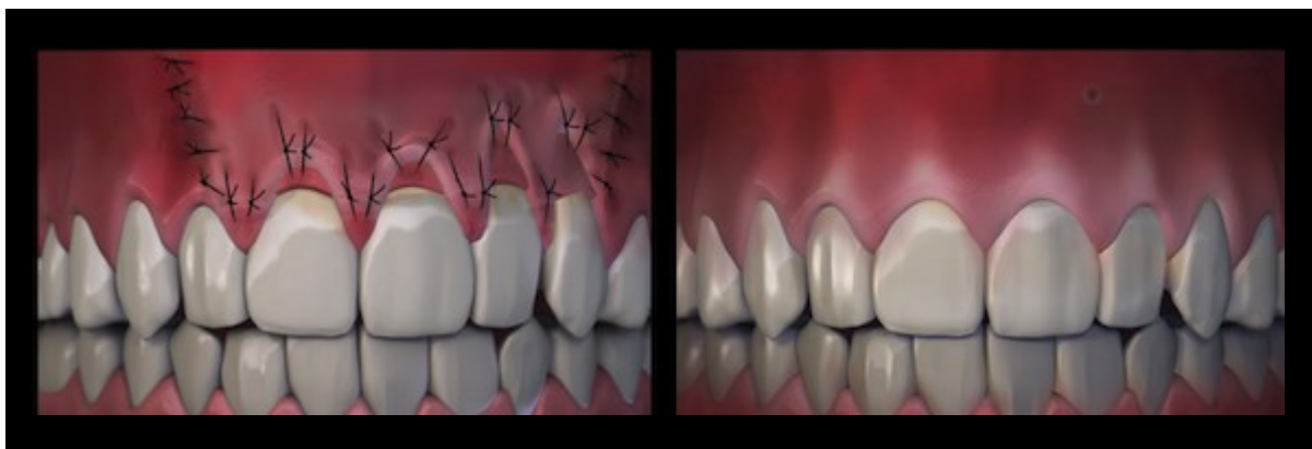
Traditional Gum Grafting versus the Pinhole Surgical Technique™

While this traditional grafting treatment is effective, comparable results with better patient experience can be achieved through the Pinhole Surgical Technique™.